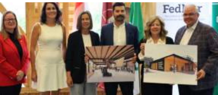
| Northern Housing Innovation Funding Announcement

The Institute for Northern Housing Innovation, located within Laurentian University's McEwen School of Architecture, will serve as a hub for research, training, and collaboration. Its mission is to develop and mobilize housing technologies tailored to the unique realities of Northern Ontario, with a strong emphasis on sustainability, low-carbon practices, and affordability.