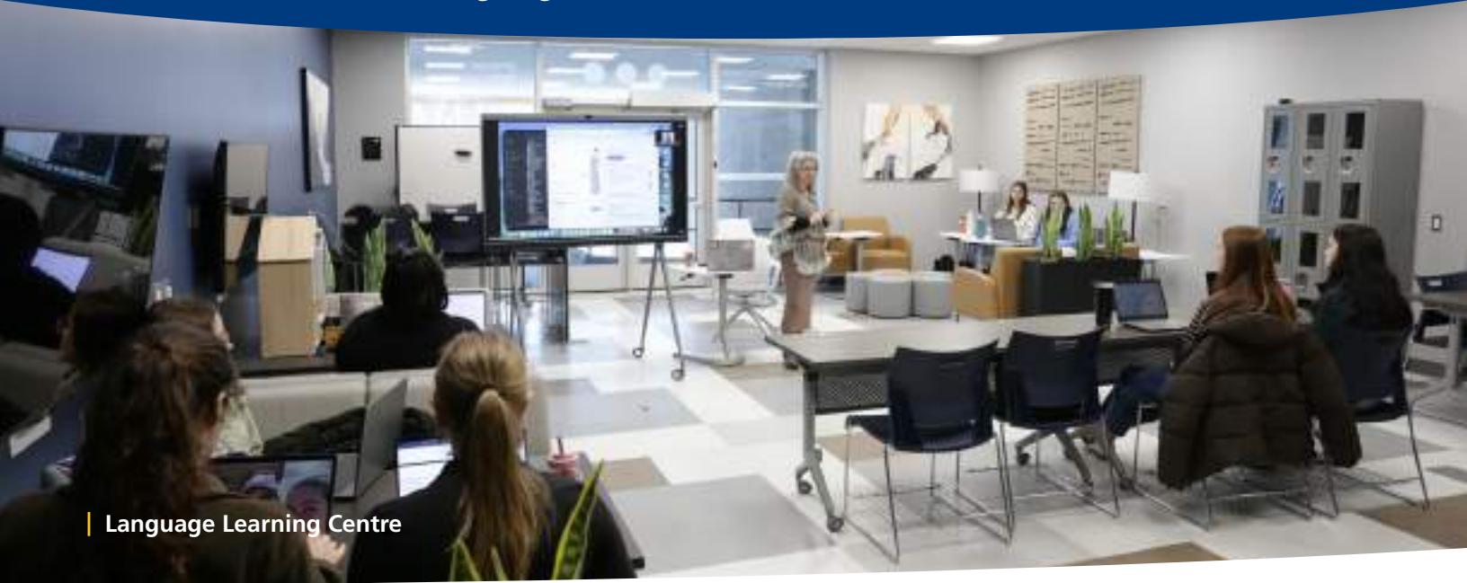
| Language Learning Centre