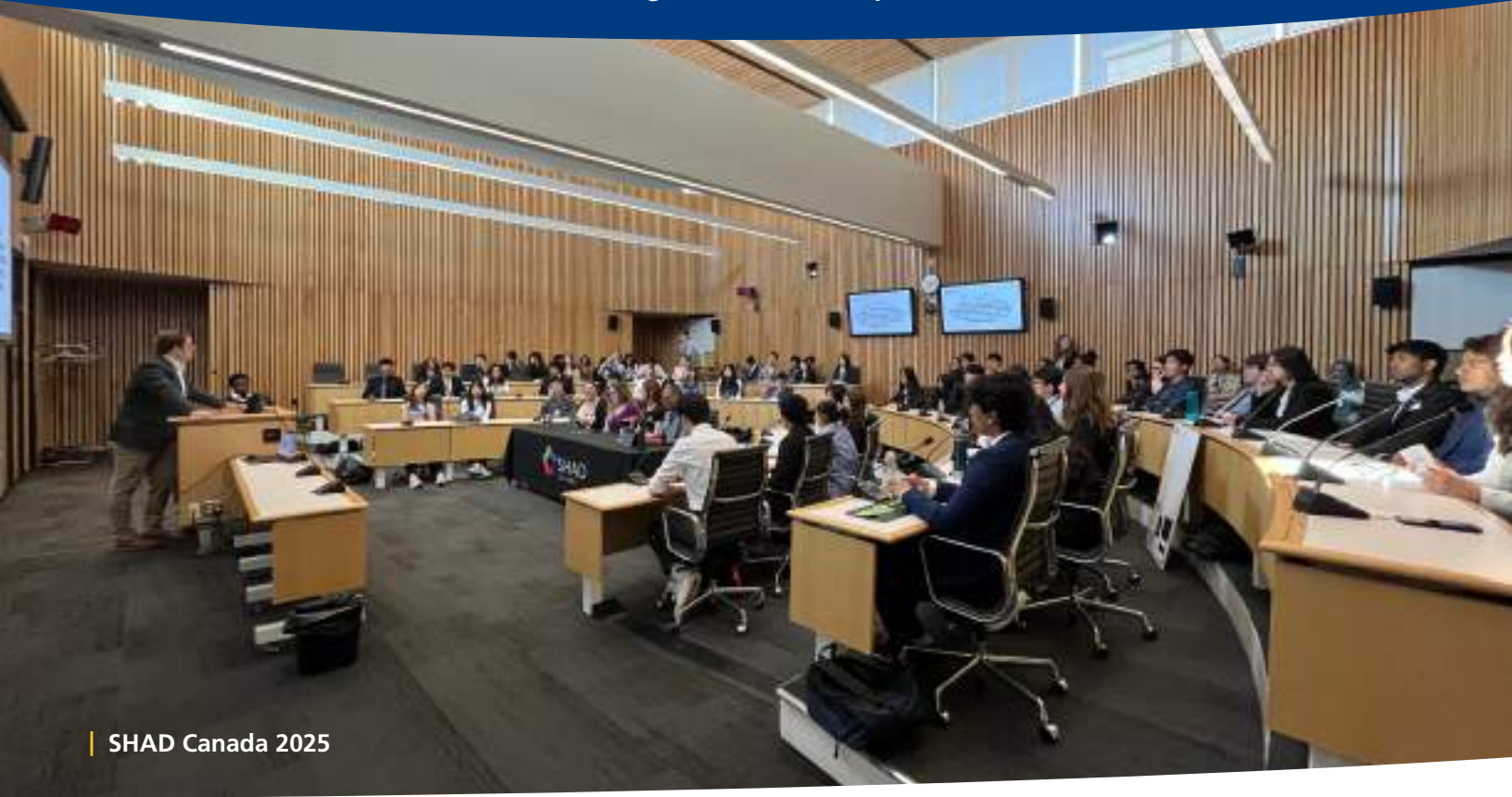
| SHAD Canada 2025