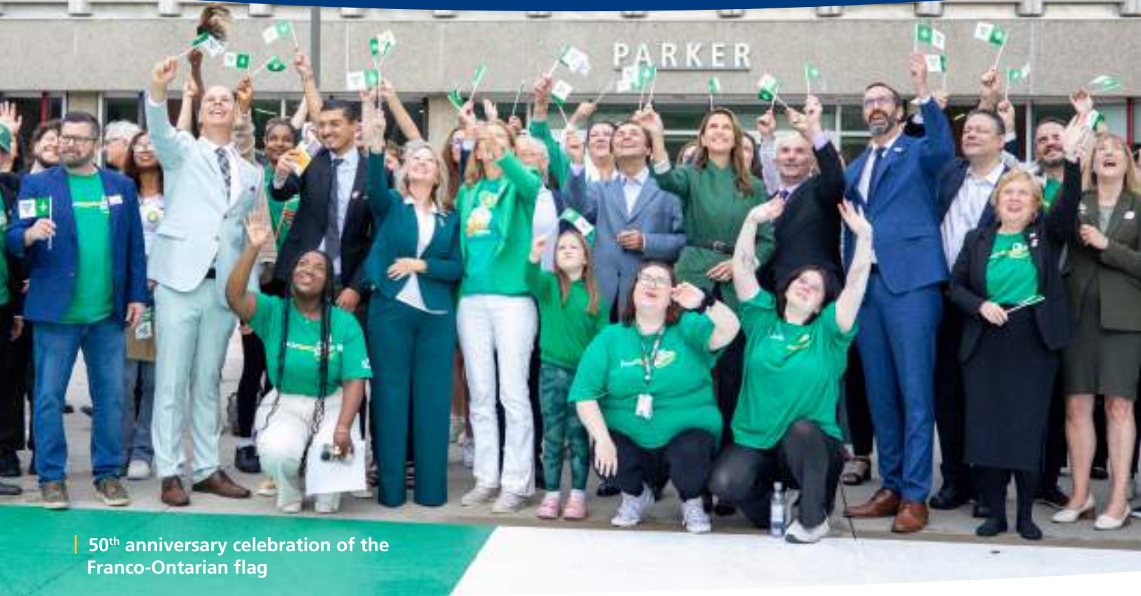
50 th anniversary celebration of the Franco-Ontarian flag