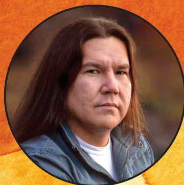
Waubgeshig Rice The Community Roots of Storytelling Careers