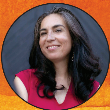
Tanya Talaga All Our Relations: Finding the Path Forward