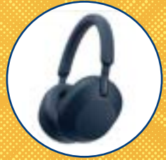
Sony WH-1000XM5 Over-Ear Noise Cancelling Bluetooth Headphones